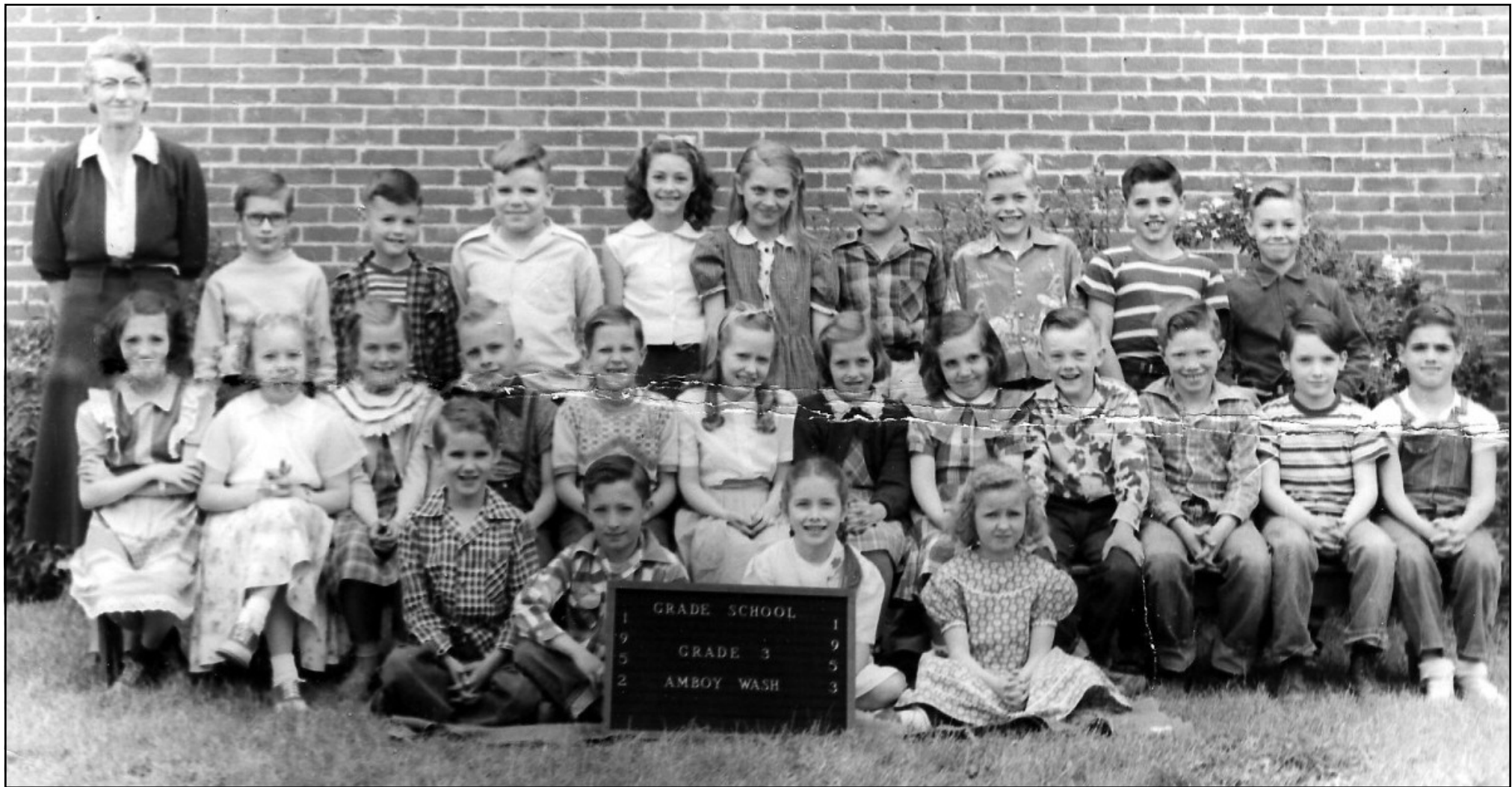
Battle Ground High School Graduation Class of 1962 Amboy Grade school—3rd grade photo 1952-1953