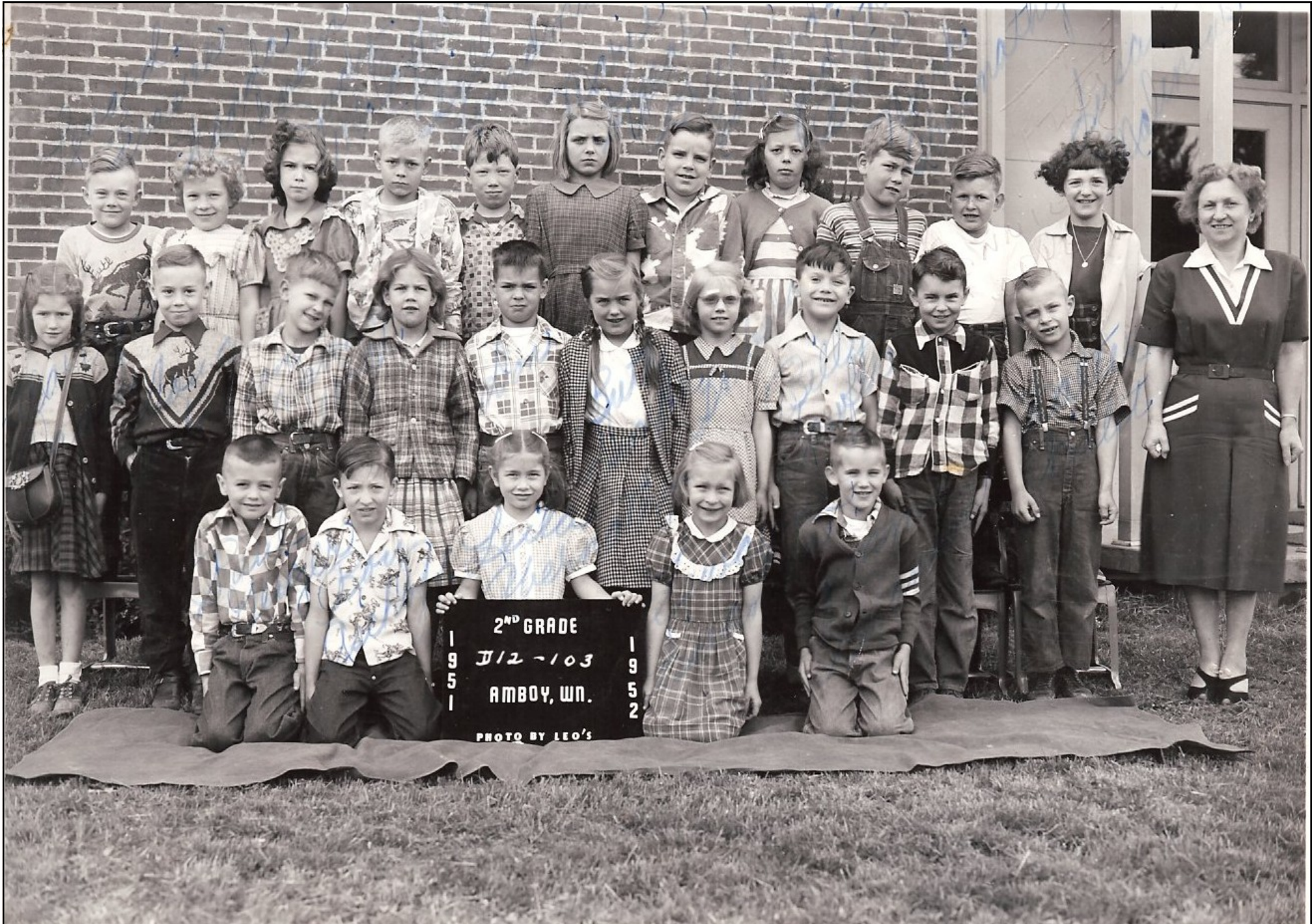
Battle Ground High School Graduation Class of 1962 Amboy Grade school—2nd grade photo 1951-1952